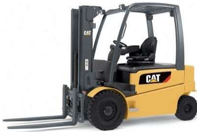
Fig. 8. Forklift

If you are receiving an LTL (Less than Truck Load) with a Lift Gate, then the truck driver will place the pallets on the LG with a pallet jack and lower them to the ground for you. At this point, you will need to be able to get them from the LG to your staging area or arena. You will need to make sure you have a forklift or a tractor with forks ( Figs. 8 & 9 ) to get the pallets from the lift gate to your staging area. Make sure your equipment is rated to lift at least 2,500 Pounds.