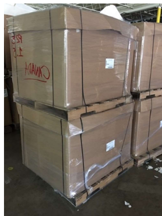
Fig. 2a. P25 fiber pallet (2 boxes)

As you can see, these skids can be very large (48"W x 58"D x 87"T)! It is important that you fully understand what to expect at delivery and make arrangements for accepting your order. This ensures a smooth and successful process. GGT-products are delivered by 28' pup trailers ( Fig. 4 ) with/without lift gates (LG), so we will need to make sure it can easily access your facility. Please let us know if delivery will be to a rural area, on a dirt road or an area restricted to tractor trailers. Due to liability reasons, the truck driver is only required to transport the product from our facility to yours and is not expected to unload.