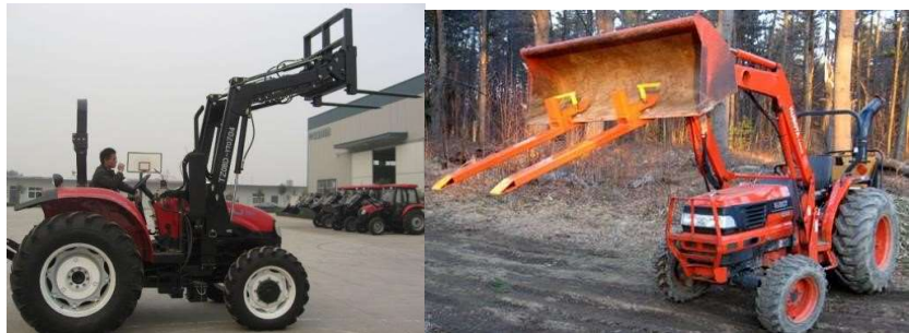
Fig. 9. Tractors with Fork attachments.

Once your order arrives, please make note of any damage during transport and contact your salesperson immediately. Note any damages on the carriers POD (Proof of Delivery). This insures we can file a damage claim, if necessary. A damage claim MUST be filed within 5 days of delivery.