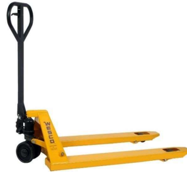
Fig. 5. Pallet Jack

If you are receiving an LTL (Less than Truck Load) with a Lift Gate, then the truck driver will place the pallets on the LG with a pallet jack and lower them to the ground for you. At this point, you will need to be able to get them from the LG to your staging area or arena. You will need to make sure you have a forklift or a tractor with forks ( Figs. 8 & 9 ) to get the pallets from the lift gate to your staging area. Make sure your equipment is rated to lift at least 2,500 Pounds.