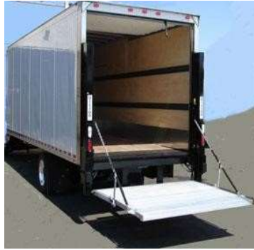
Fig. 4. 28' Pup Trailer with Lift Gate

This means that you will need to have someone on site and prepared with the necessary equipment to unload it. Most residential deliveries will have a delivery appointment, meaning that the trucking company will call you to coordinate a date and time. A Lift Gate Service can be requested. A Lift Gate (LG) is a platform that is attached to the rear of the truck and is used to lower heavy items to ground level ( Fig.4 ). This is very helpful if there is not a loading dock at the delivery site. This service will also include a pallet jack, shown in Fig. 5 , for moving the product from inside the trailer to the lift gate.