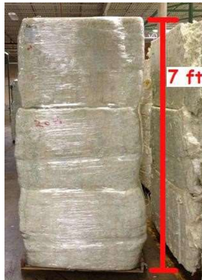
Fig. 2. A complete footing pallet.